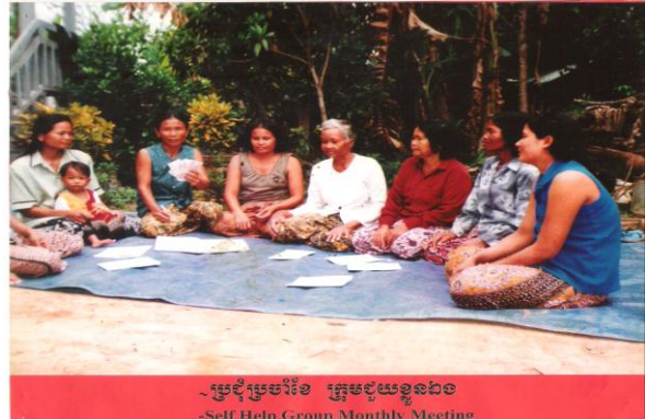
Self Help Group Monthly Meeting