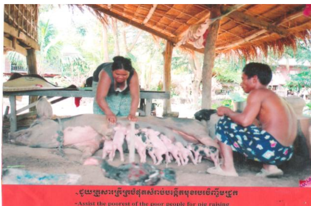
Assist the poorest of the poor people for pig raising

In 2009 ACED supported 64 families with loans without interest rates of amount $ 2,500.00 (two thousand five hundred U.S. dollars). Now the families have the capital needed for starting up small-scale businesses that means income for food, health care, and children's education e.g. a better living for the families.